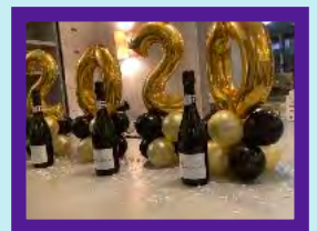
Welcoming 2020 with open hearts and minds

Wishing everyone a happy new year from all of us at St. Bernards Residential Care